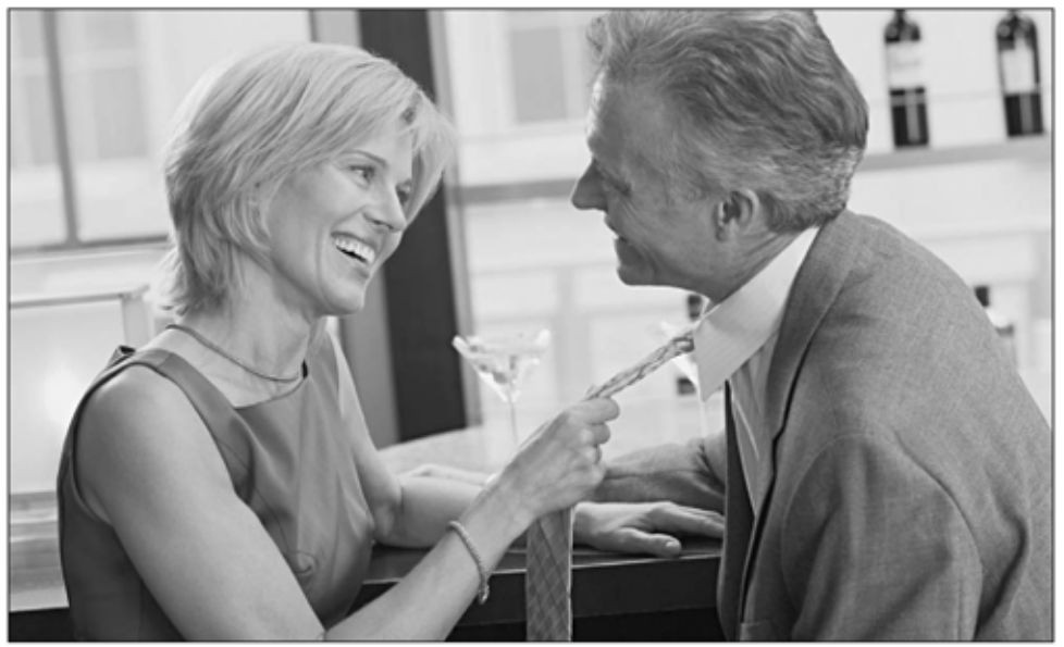
Think your best days are behind you? Think again.