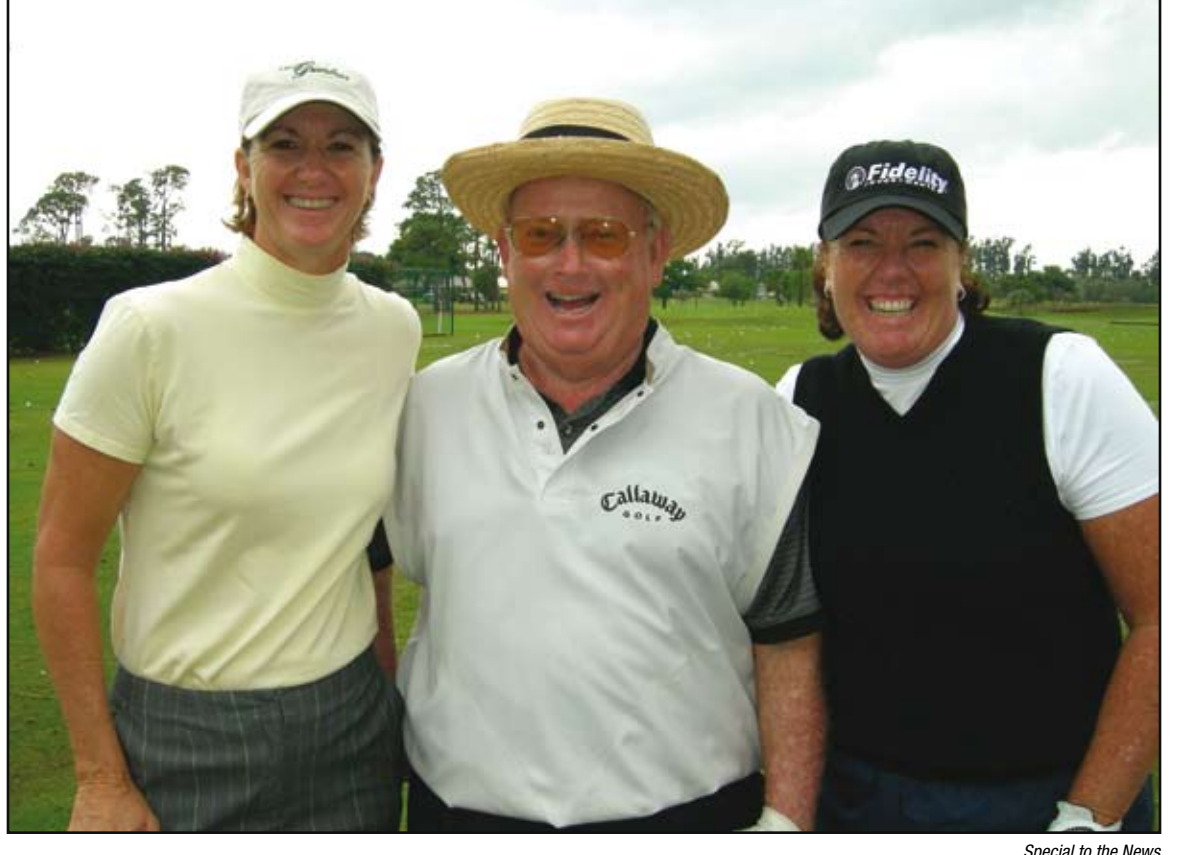
Special to the News