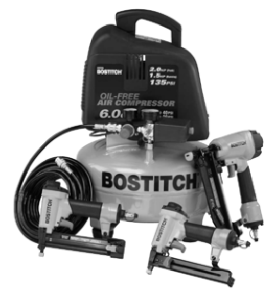
COMPRESSORS & PNEUMATICS